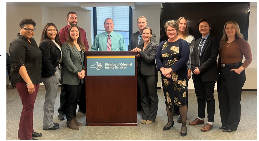
Congratulations to all of the graduates of the 2023 Instructor Development Course!

tion Academy Directors and anticipated revisions to Part 346-Staff Development Rule. Updates were also provided by each of the local academies on the status of their own FPP and BCPO academies. Each Unit within OPCA delivered important training related information specific to their areas of responsibility. A recording of the meeting will be made available <a href="here">here</a>. The next meeting will be on May 9, 2023.