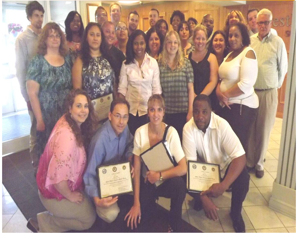
Albany OWDS Class of 2012